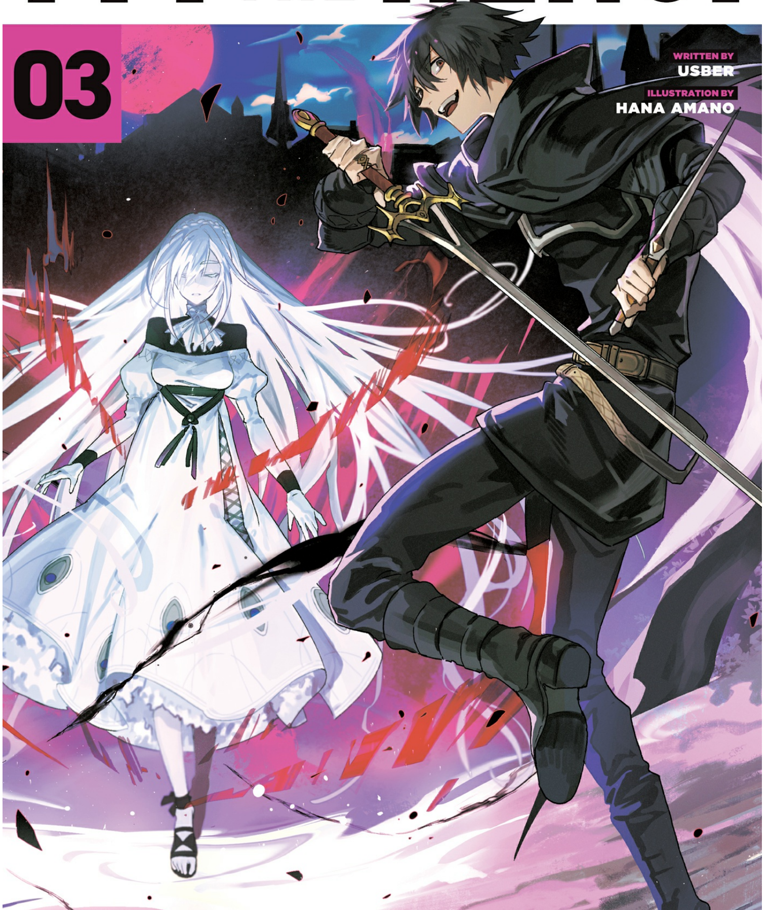
ILLUSTRATION BY HANA AMANO