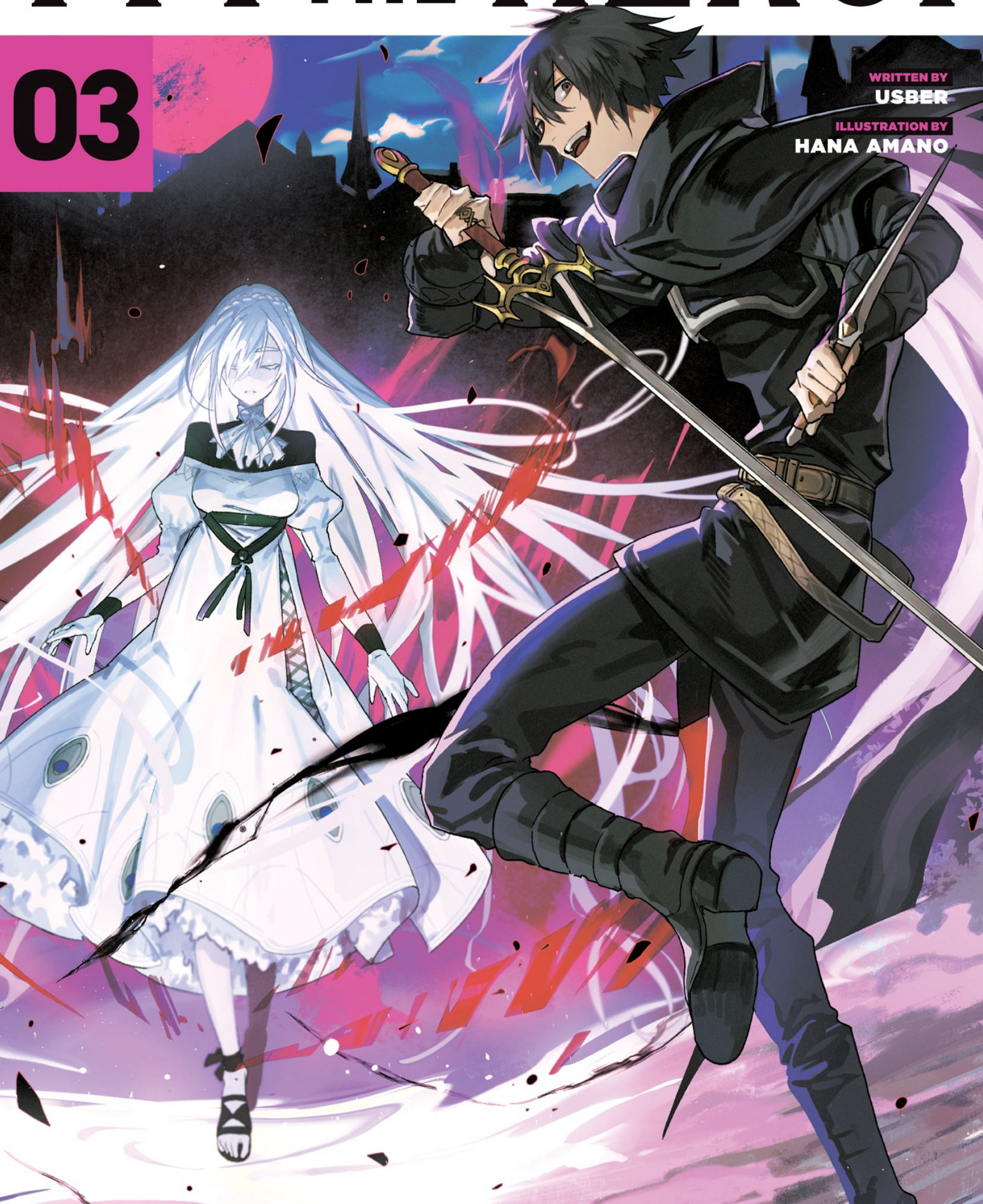
ILLUSTRATION BY HANA AMANO